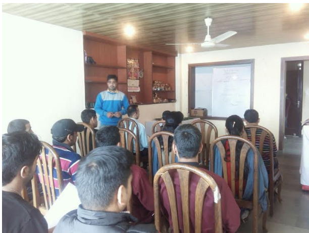
Consultation regarding the Skill Development