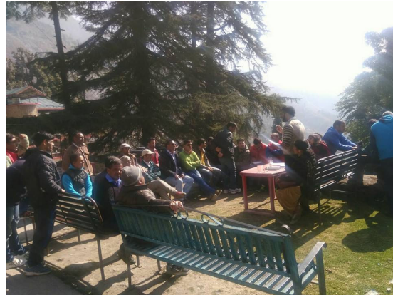
MC officials and Experts having Citizen consultation