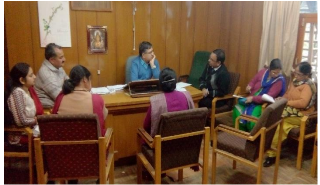
Meeting with Lead District Manager and Task force committee members