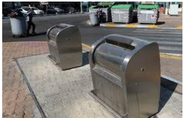
Underground Dustbins Proposed for MC Dharamshala