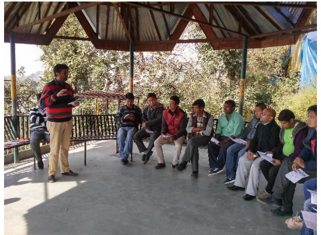
Ward Level Meetings on SMART CITY.