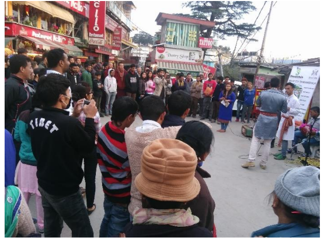
Mass Media Activities on SMART CITY.